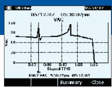
TrendCapture displays vAC logged data.