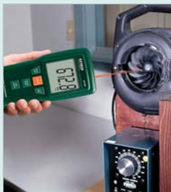
Photo Tachometer function measures the speed of rotating objects without contacting the surface by using a laser beam and reflective tape