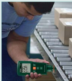
Contact Tachometer function measures the speed of rotating objects by placing the wheel tip into the surface.