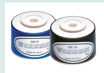
RH300-CAL Optional calibration salt bottles