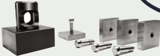
PosiTest AT 50T KIT measures the tensile strength of ceramic tile adhesives.