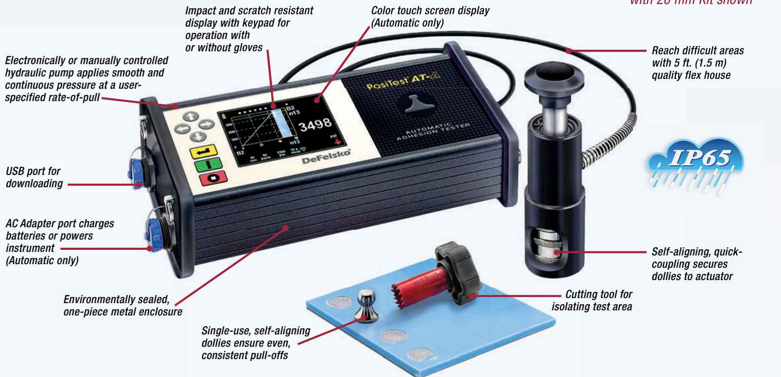
PosiTest AT-A Automatic with 20 mm Kit shown