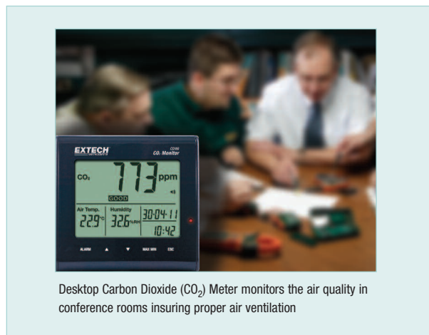
Desktop Carbon Dioxide (CO 2 ) Meter monitors the air quality in conference rooms insuring proper air ventilation